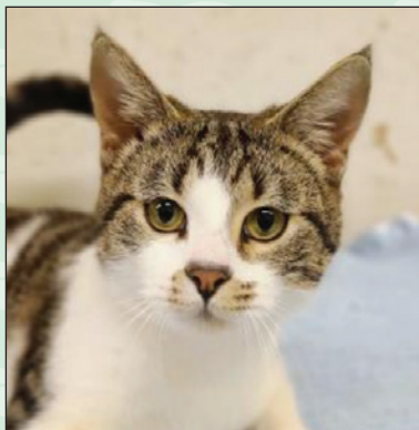
Hi, my name is Kobe! You can adopt me from Pound Puppies N' Kittens Inc., located in Social Circle. Call 770-464-3393 to learn more.