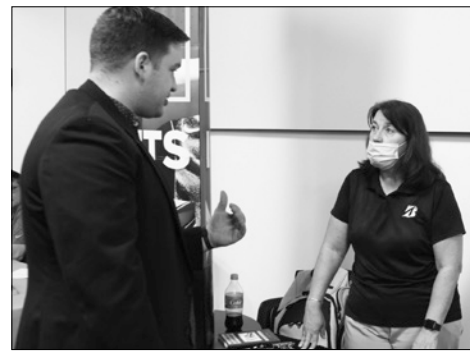
A prospective applicant visits the Bridgestone Golf booth at the 2021 Regional Job Fair.

“Some of what separates the Newton/Walton region from our counterparts is that longstanding regional cooperation between private industry, government entities and authorities, educational institutions, and the chambers of commerce,” he said. “Community eco-