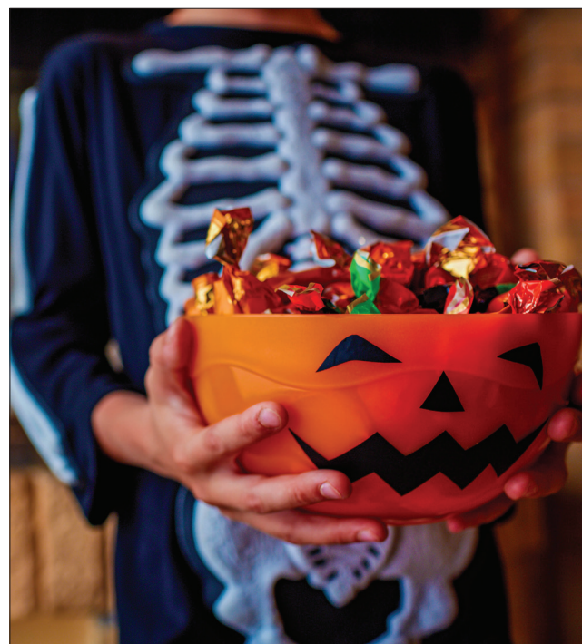
Metro Creative Services

"Although the COVID-19 pandemic has changed the types of Halloween activities children and families would typically participate in, like haunted houses or indoor Halloween parties, there are still ways to have fun while keeping yourself and others safe," Brown said. "The CDC has provided guidelines that outline the risk of specific activities, and I think families will find there are many low risk activities they can do