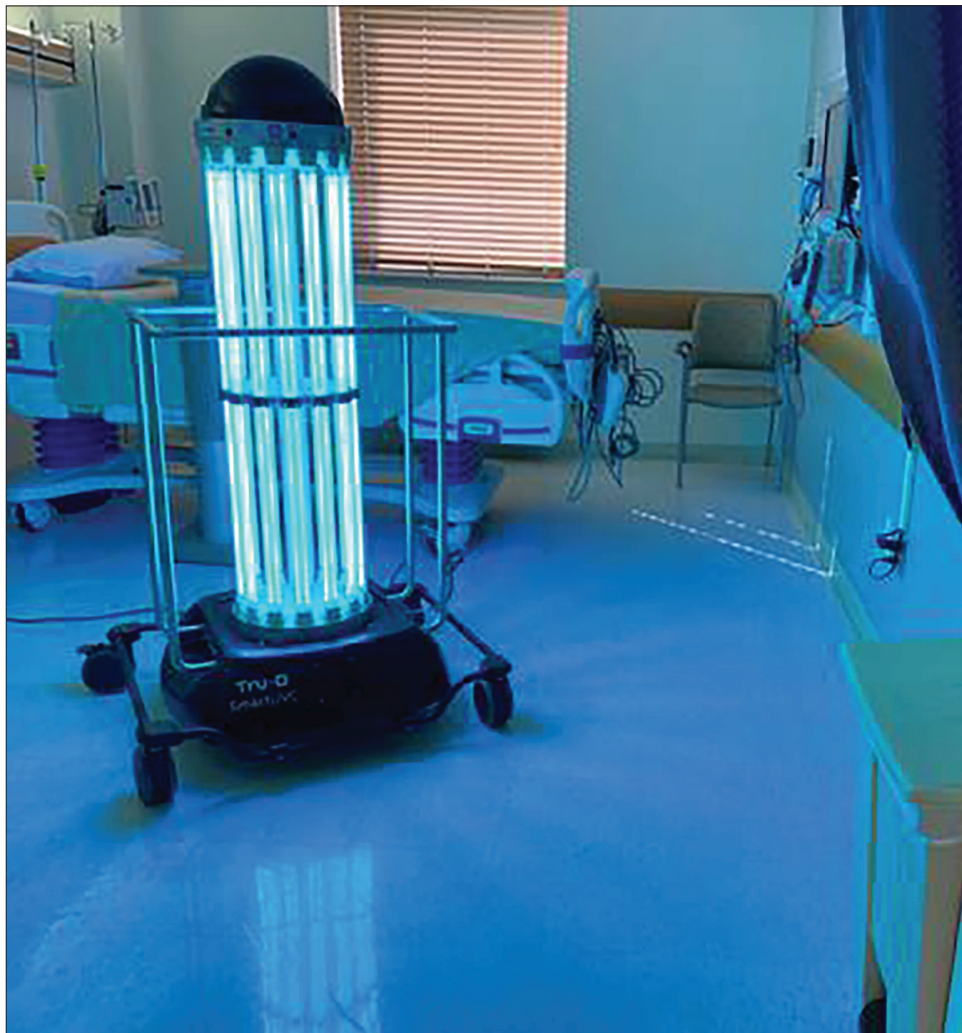
Tru-D is placed inside a patient room at Piedmont Newton Hospital.

COVINGTON, Ga. — Piedmont Newton Hospital recently added the Tru-D system, a pathogen-reducing UVC robot, to its already stringent list of disinfection protocols aimed at providing the cleanest health care environment possible. The Tru-D device, now part of PDI Healthcare's market-leading infection prevention solutions, is one way Piedmont Newton is raising the bar when it comes to the level of care it provides to all patients. "The acquisition of this technology is simply another way that we're working to safeguard the well-being of every single patient who walks through our doors and protect the integrity of our health care environment," said Piedmont Newton Executive Director of Patient Services Bill Love.