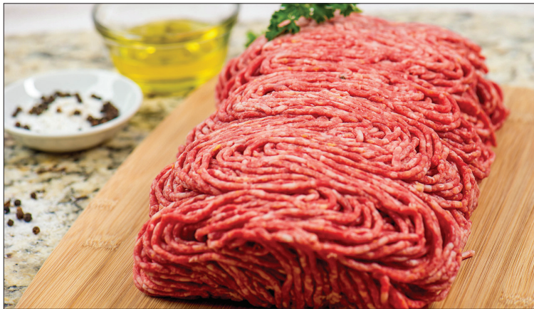
Shepherd's pie and cottage pie are the stars of Irish and British country cooking. Enjoy this recipe for "Cottage Pie," courtesy of Martha Stewart. To turn it into a "Shepherd's Pie," simply replace the ground beef with ground lamb.

The terms shepherd's pie and cottage pie are sometimes used interchangeably to describe layered dishes featuring a meat-and-vegetable base topped with potatoes. Shepherd's pie and cottage pie are widely enjoyed across Great Britain and Ireland. While very similar, they are not the same. Cottage pie is the elder of the two recipes, believed to date back to 1791 in England. Shepherd's pie came about nearly a century later and can be traced to Ireland, indicates British Grub Hub. Both creations are now enjoyed around the world, as these pies are savory comfort foods. There is a distinct difference between the two recipes, and that comes down to the meat. Cottage pie uses minced beef while shepherd's pie uses minced lamb or mutton. Another distinction between the two is that it was believed earlier incarnations of cottage pie did not use mashed potatoes on the top, while shepherd's pie has always included mashed potatoes. Sliced potatoes were originally layered on a cottage pie to make the dish look like the shingled