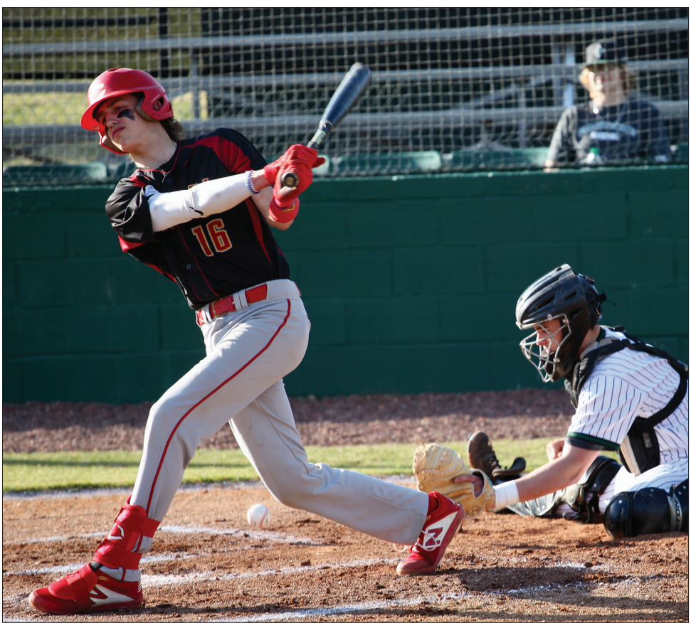
Eastside racked up 11 strikeouts while holding Region 8-AAAAA foe Clarke Central to just two hits in Monday's 11-1 victory at the Eagle's Nest.