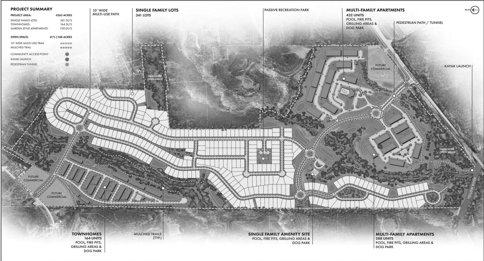
Pictured is a rendering of the master plan for Cedar Shoals in Porterdales.