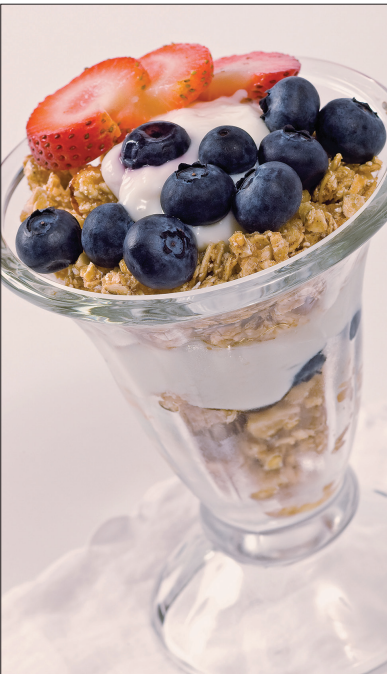
Research and data from the University of Pennsylvania School of Medicine's Center for Weight and Eating Disorders indicates that when food is consumed late at night the body is more likely to store those calories as fat and gain weight rather than burn it off as energy.