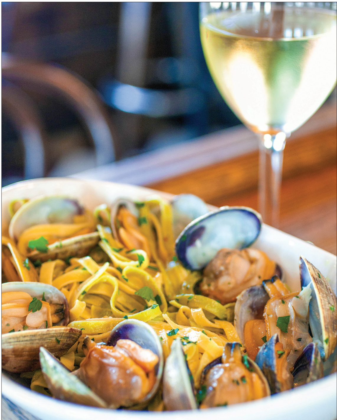
Metro Creative Services Some basic pairing knowledge might be all that's truly necessary to make a meal more memorable.

Pairing a delicious meal with the perfect wine can be a match made in heaven. Wine novices may be intimidated by the challenge of making the perfect pairing, but they need not put themselves under such pressure. Just because a certain wine might make for a perfect pairing, that doesn't mean others cannot step in and serve an equally flavorful function. People who appreciate a great meal accompanied by an equally great wine need not have an encyclopedic knowledge of food or wine to successfully pair the two together. In fact, some basic pairing knowledge might be all that's truly necessary to make a meal more memorable. • White and light: White wine fans should know that such wines tend to pair best with light meat, such as chicken or fish. According to Backbar, a platform designed to help bars and restaurants manage their inventory more effectively, white wines pair well with fish because the acidity in these wines enhances the taste of the fish. Chicken dishes vary greatly, and the online wine resource Wine Folly ( www.winefolly.com ) notes that the sauce will greatly affect the flavor of the meat. That means a wine that pairs well with a certain chicken dish may not necessarily pair as well with a different one. Representatives at local liquor stores or wineries can help people choose which wine to pair