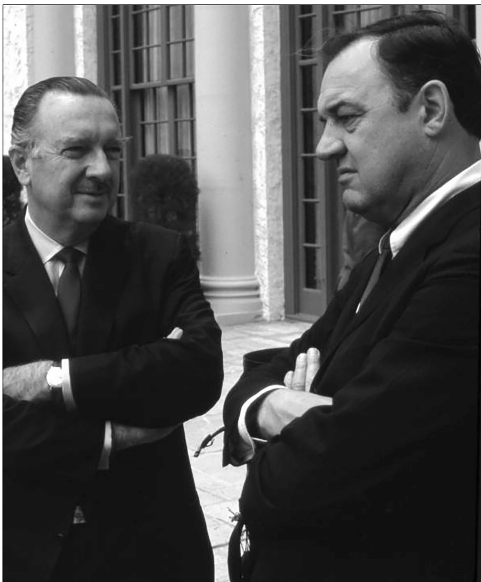
Walter Cronkite, left, stands with Florida Gov. Claude Kirk, right, in 1967. Cronkite was anchor for the CBS Evening News for 19 years (1962–1981). During the 1960s and 1970s, he was often cited as "the most trusted man in America" after being so named in an opinion poll.

In 1968, Cronkite went to Vietnam to see who was really winning the war. Much to President Johnson's chagrin, the anchorman compiled a one-hour program showing the harsh realities of American casualties that had previously been under-counted and under-reported. At the end of the program (buckle up, folks), Cronkite... expressed his opinion! He said, "It seems now, more certain than ever that the bloody experience of Vietnam is to end in a stalemate. It is increasingly clear that the only rational way out will be to negotiate, not as victors, but as an honorable people who lived up to their pledge to defend democracy, and did the best they could." Wait, what? We couldn't win the war? At least, that was Walter Cronkite's informed