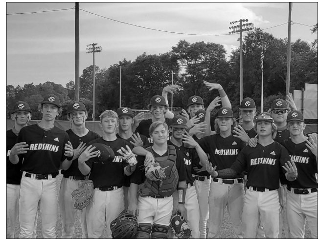
Special to The Covington News No. 3 Social Circle knocked off No. 2 seed Taylor County in the first round of the Class A-Public state playoffs.

Following a hard-fought, 9-5 loss to the Vikings in Game 1, the