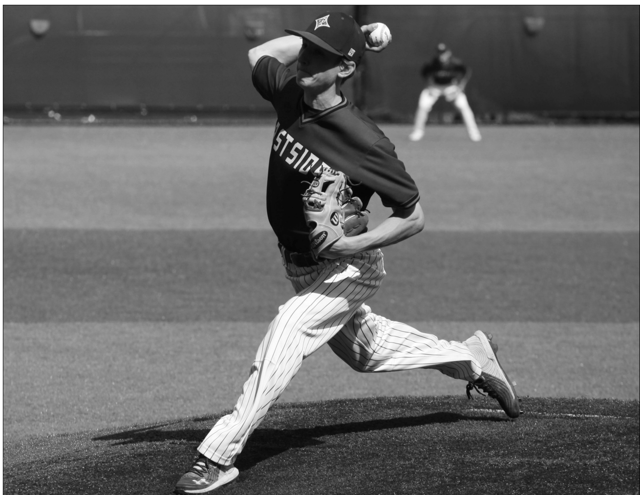
No. 3 seed Eastside fell to No. 2 seed St. Pius X in three games in the opening round of the Class AAAAA state playoffs this week. The Eagles collected a Game 1 victory before dropping back-to-back contests and being eliminated.