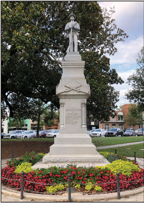
The Confederate memorial statue has stood on the Covington Square since 1906 1906.