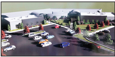
NCSO breaks ground on Alcovy expansion | See A2