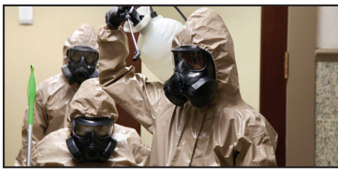
Chief judge declares judicial emergency | Below the fold

His Word Blessed are they that mourn: for they shall be comforted. Blessed are the meek: for they shall inherit the earth. Blessed are they which do hunger and thirst after righteousness: for they shall be filled. — Matthew 5:4-6, KJV