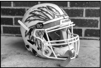
Brett Fowler | The Walton Tribune

Members of the community are calling for Social Circle City Schools to change its mascot from the Redskins.