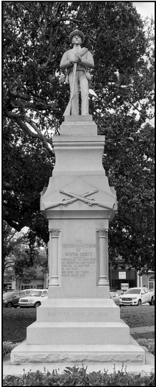
The Confederate memorial statue has stood on the Covington Square since 1906. Tuesday, the Newton Board of Commissioners voted to remove it, but an injunction against the board has placed its plans on hold.