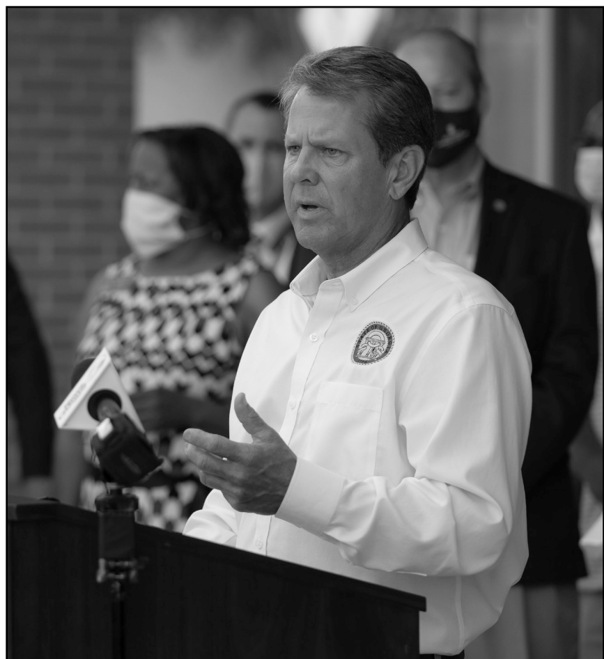
Office of Gov. Brian Kemp

Gov. Brian Kemp speaks on the subject of masks in Augusta during his “Wear A Mask” tour earlier this month. He recently extended social distancing and safety rules through the end of July, but ruled local mask mandates ‘unenforceable.’