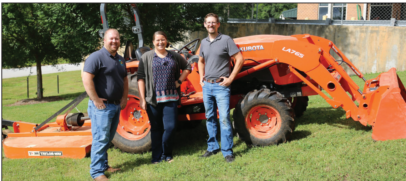
The Newton County College and Career Academy Agricultural Education Program was recently awarded a $99,974 grant from the USDA. It will help further fund the program’s Blue and Gold Acres project that gives students a more hands-on learning experience.