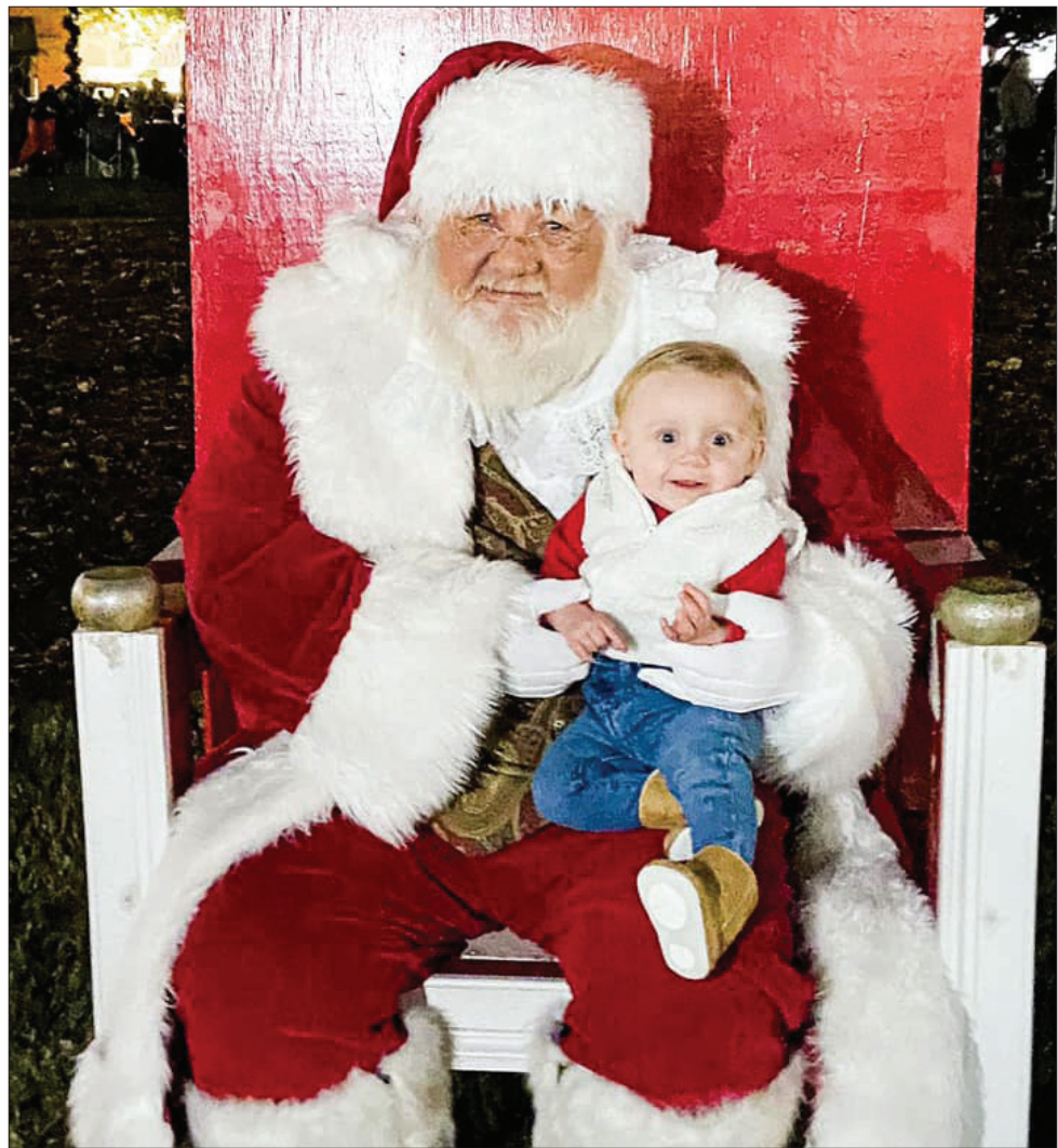
Special to The Covington News

Spectators enjoyed performances by the Covington Regional Ballet Motion Dance Ensemble (pictured) and the Community Band Brass Ensemble.