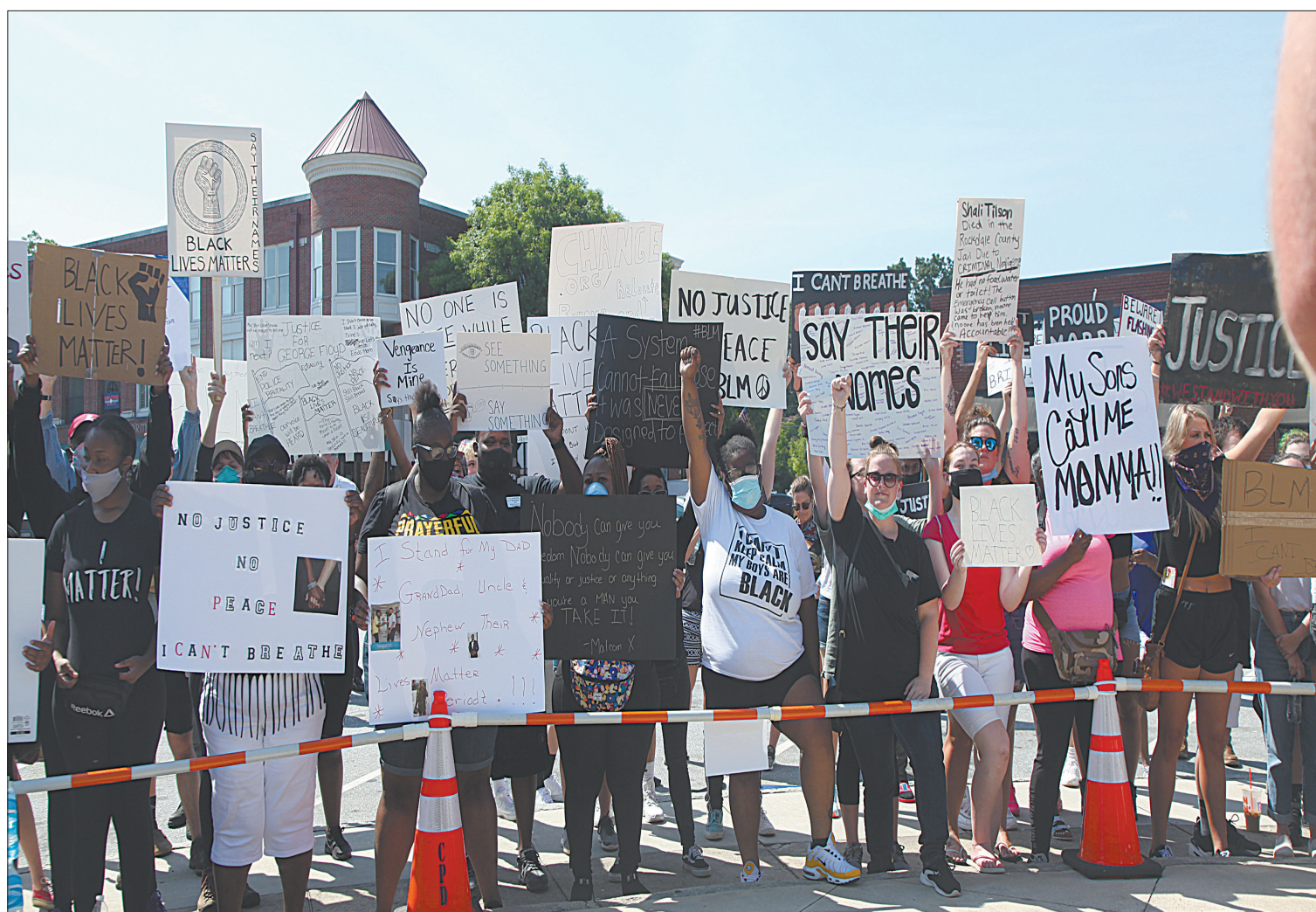
A multitude of citizens peacefully protested police brutality in America on the Covington Square on Wednesday.