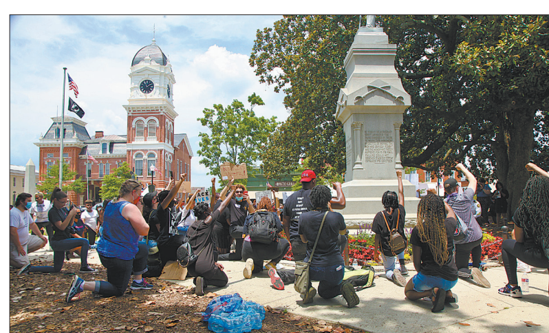
Newton County citizens gathered on the Covington Square on Wednesday for a peaceful demonstration in the wake of the death of George Floyd.