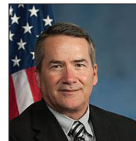
Rep. Jody Hice.

"I'm not taking sides publicly," he said, "the people of the state of Georgia will work that out. But we have two phenomenal candidates and I'm very proud of both